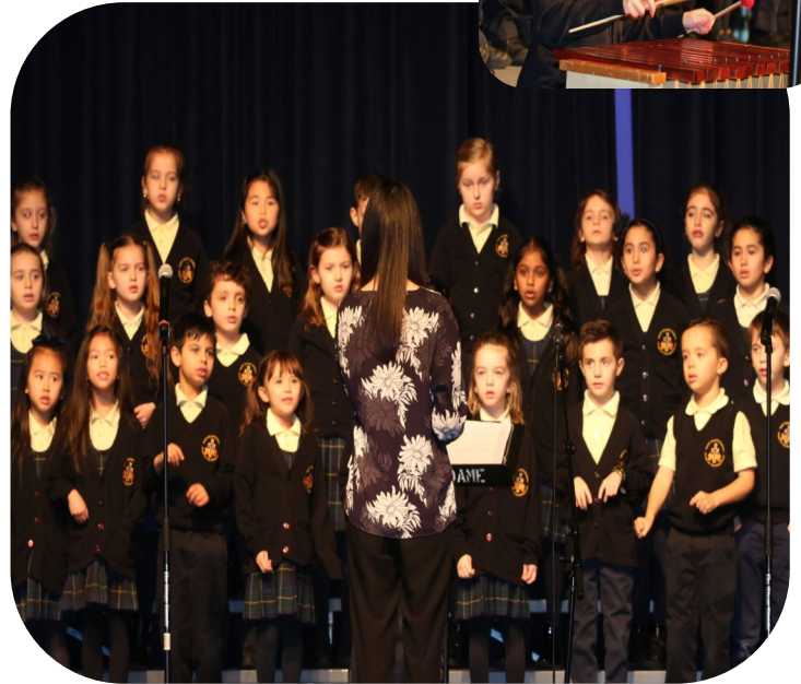
St. Helen's Students taking part at the first Notre Dame Fine Arts Festival on February 7th.