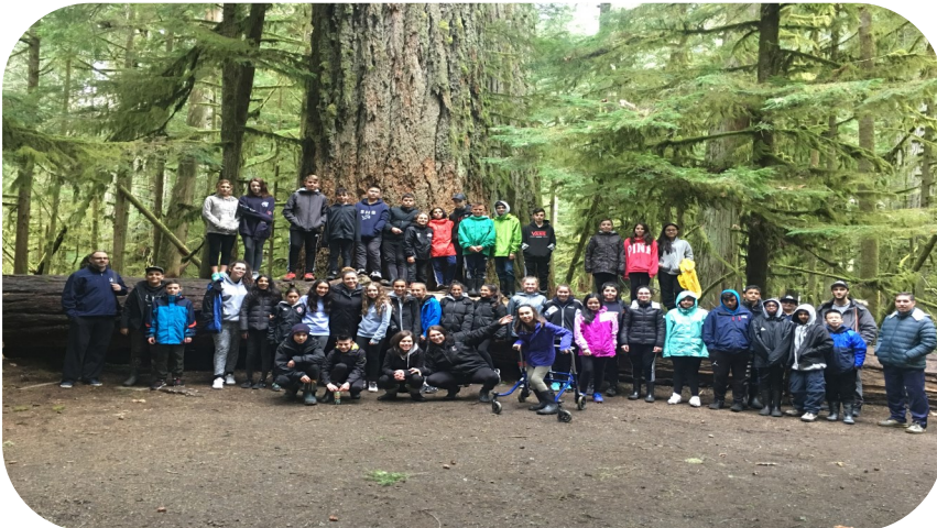
Gr. 7's in Cathedral Park on the way to Bamfield