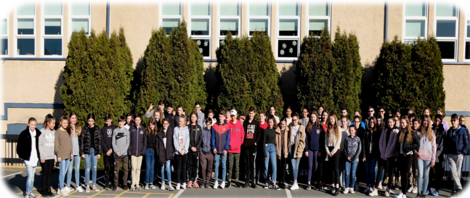
Gr.7 Confirmation Retreat

*Please refer to our online calendar for further events & information. You may also download our school app .