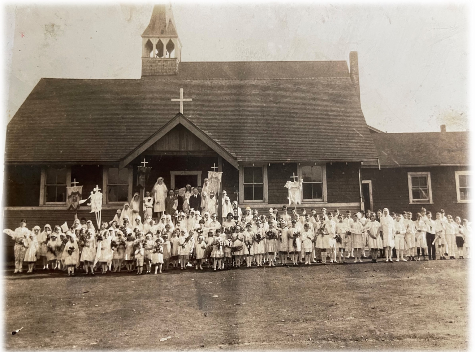
St. Helen's School 1928 / Crowing of Mary

Starting Sept of 2023—June 2024 we will be celebrating our 100th anniversary of our school. We are in the process of collecting memorabilia, photos and stories from anyone who attended our school between 1923-1946. If you have anything to contribute, please forward it to the school office at secretary@shschool.ca