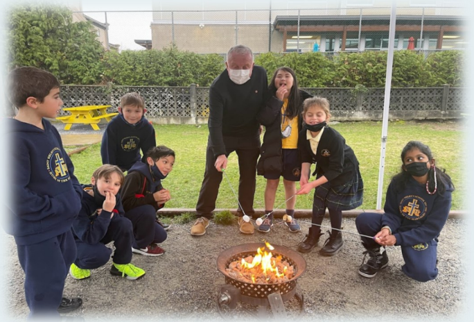
Celebrating with s'mores