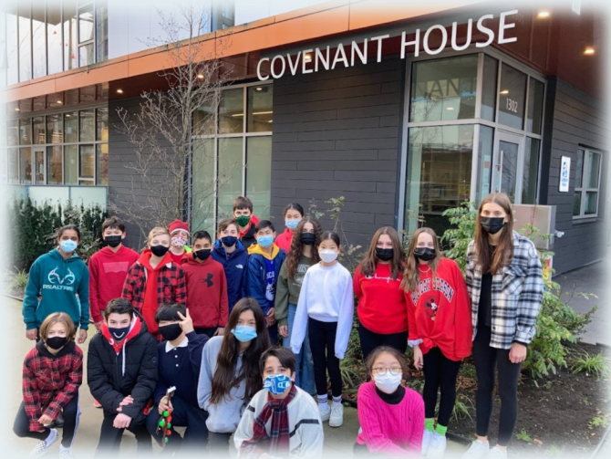
Covenant House 2021