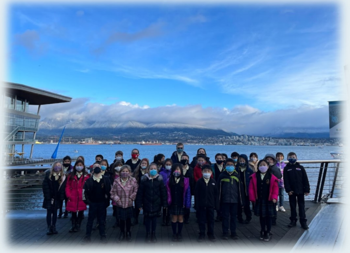
Gr. 2 Canada Fields Trip