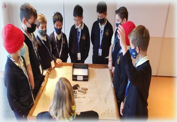
Grade 4 Field Trip