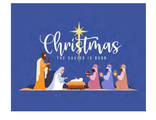
Please note times of Christmas Concert: Wednesday, December 20th @ 1pm Thursday, December 21st @ 1pm & 7pm (must arrive at 6:30 pm)