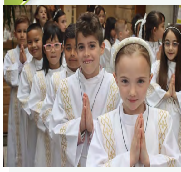
Click here to see photos from the grade 7 's Confirmation.

Click here to see more photos from the grade 2's 1st Communion