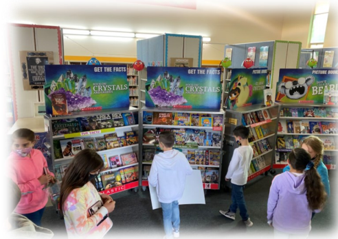
2020-2021 Book Fair