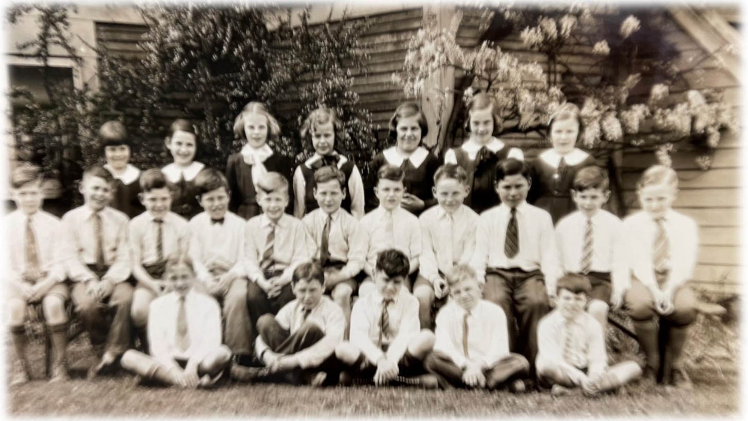
Class of 1938

Our 100 year anniversary will take place Sept 2023!