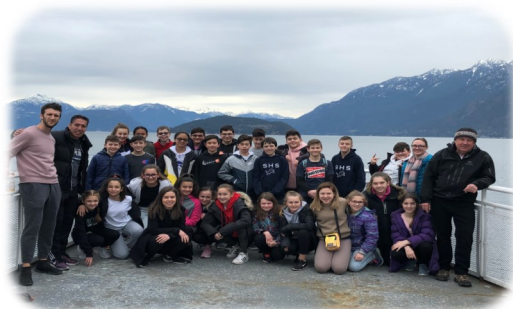
Gr. 7's on their way to Bamfield!

Our Catholic schools have an important role in fostering and nurturing vocations. It is of the utmost importance that we remind our young people of the love which God the Father has for them and to encourage them to trust the plan that He has for their lives.