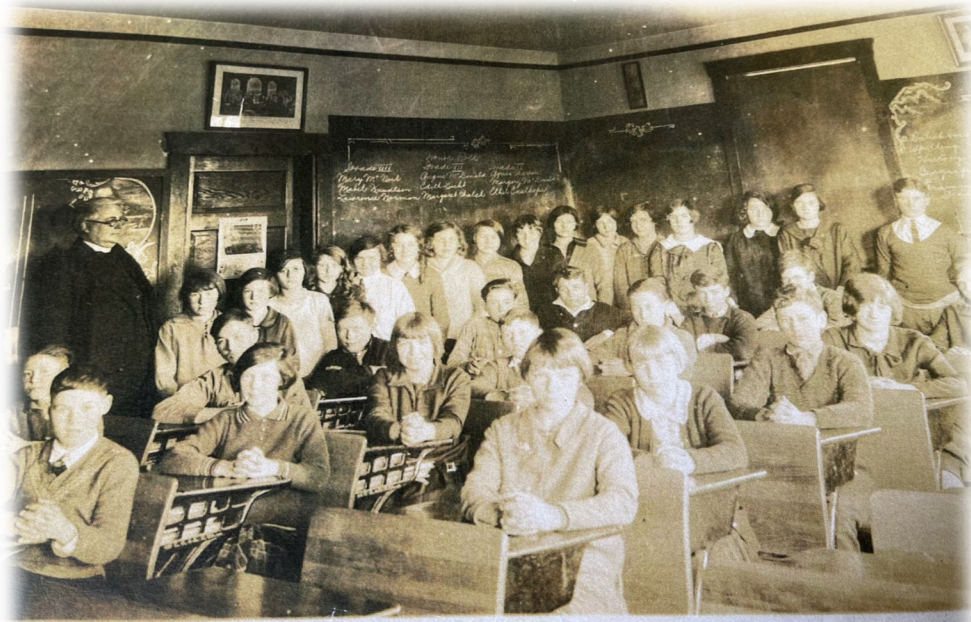
ST. HELEN'S SCHOOL—YEAR 1926