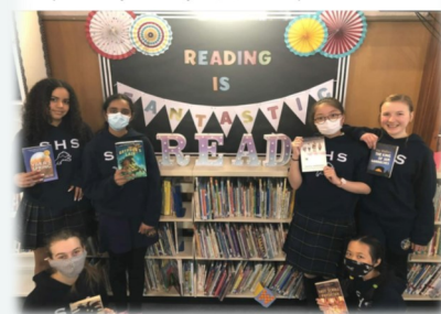
Readers Are Leaders

Congratulations to our Readers are Leaders Team who competed in yesterday's CISVA competition.