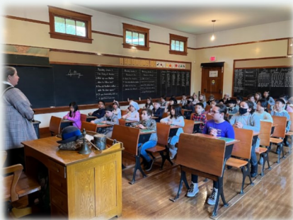
Grade 2 Field trip