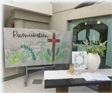
Grade 2 Reconciliation

Congratulations to our Readers are Leaders Team who competed in yesterday's CISVA competition.