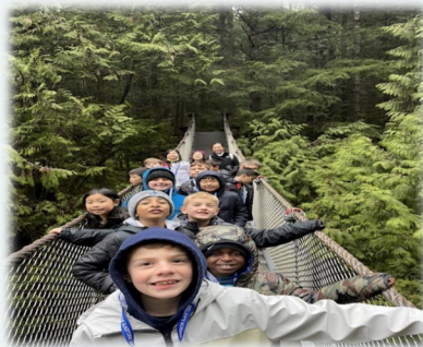
Grade 3 Field Trip