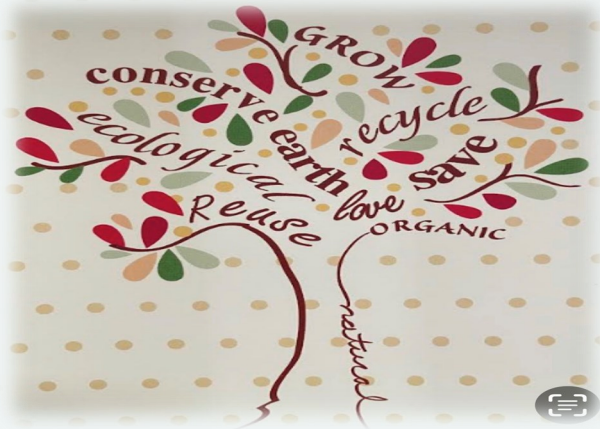
Celebrating Earth Day the entire week of April 24th-28th

https://photos.app.goo.gl/6bvQk3ax56H13RzL7