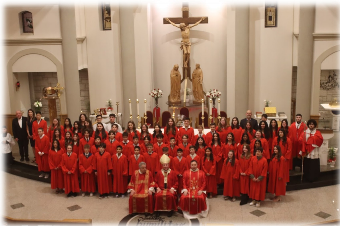
Our Grade 7 students receiving their sacrament of Confirmation