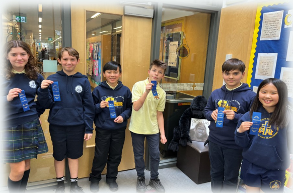
Readers are leaders