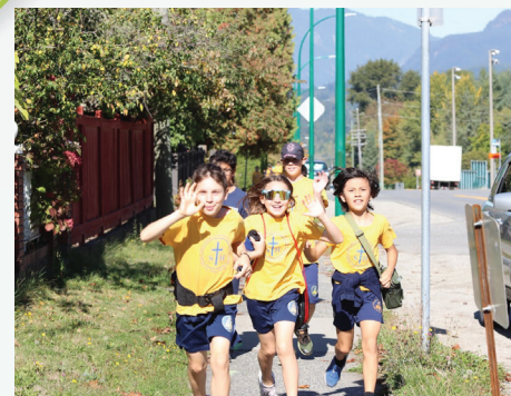
Walk-A -Thon (above) Blessing of the Pets(below)