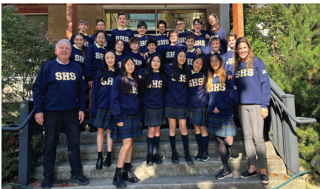
Above is grade 7 class in their graduation sweatshirts.