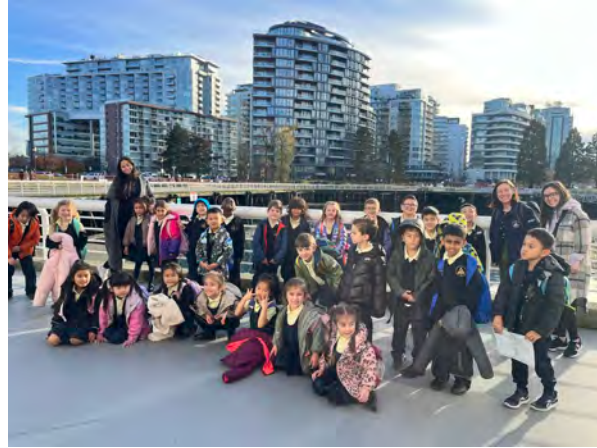
Gr. 1 at Science World