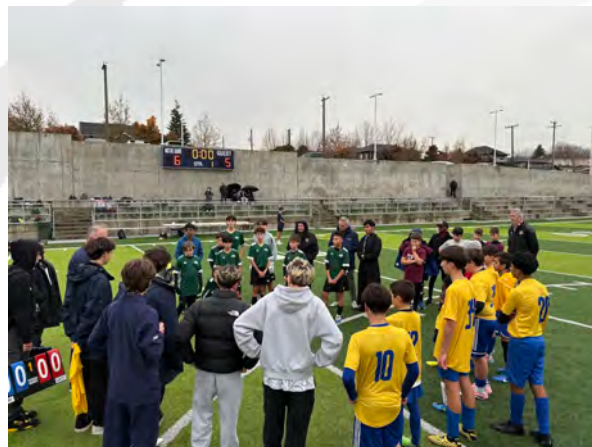
Sr. Boys Soccer @ ND for the Juggler Cup