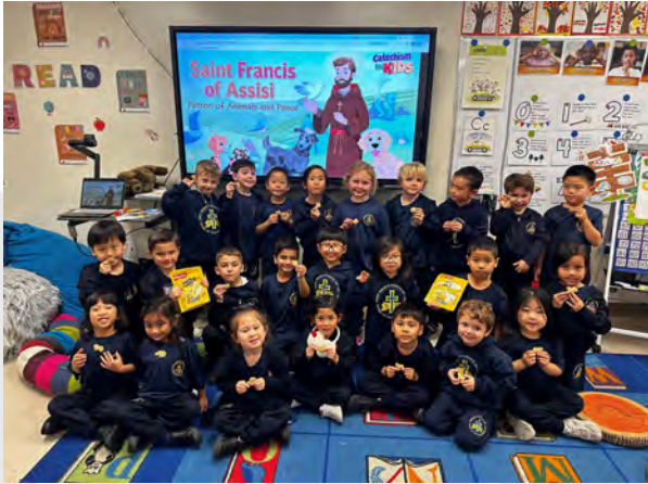
Our Kindergarten's learning about St. Francis