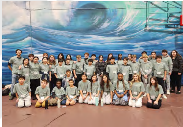
Gr. 7 at Spirit Day