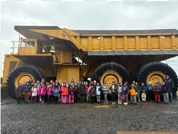
Gr. 5 at Britannia Mines