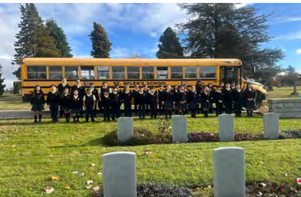
Gr. 6 at the Cemetery

More photos are updated to our website here https://www.sthelensschool.ca/photos-2025-2026.php