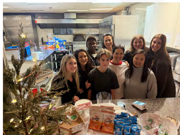
Christmas spirit at St. Helen's! More photos can be found on our website at https://www.sthelensschool.ca/photos-2025-2026.php